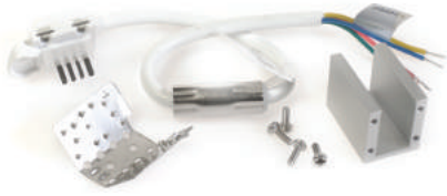
RGB Front Connector IF-F-FC01B/FC02B