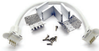
RGB Jumper IF-F-JP