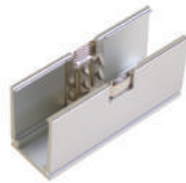
2" U-Channel with lock IF-LUC-2