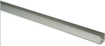
40" U-Channel IF-UC-40