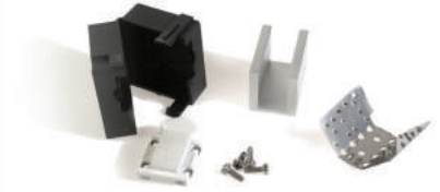
End Cap IF-EC